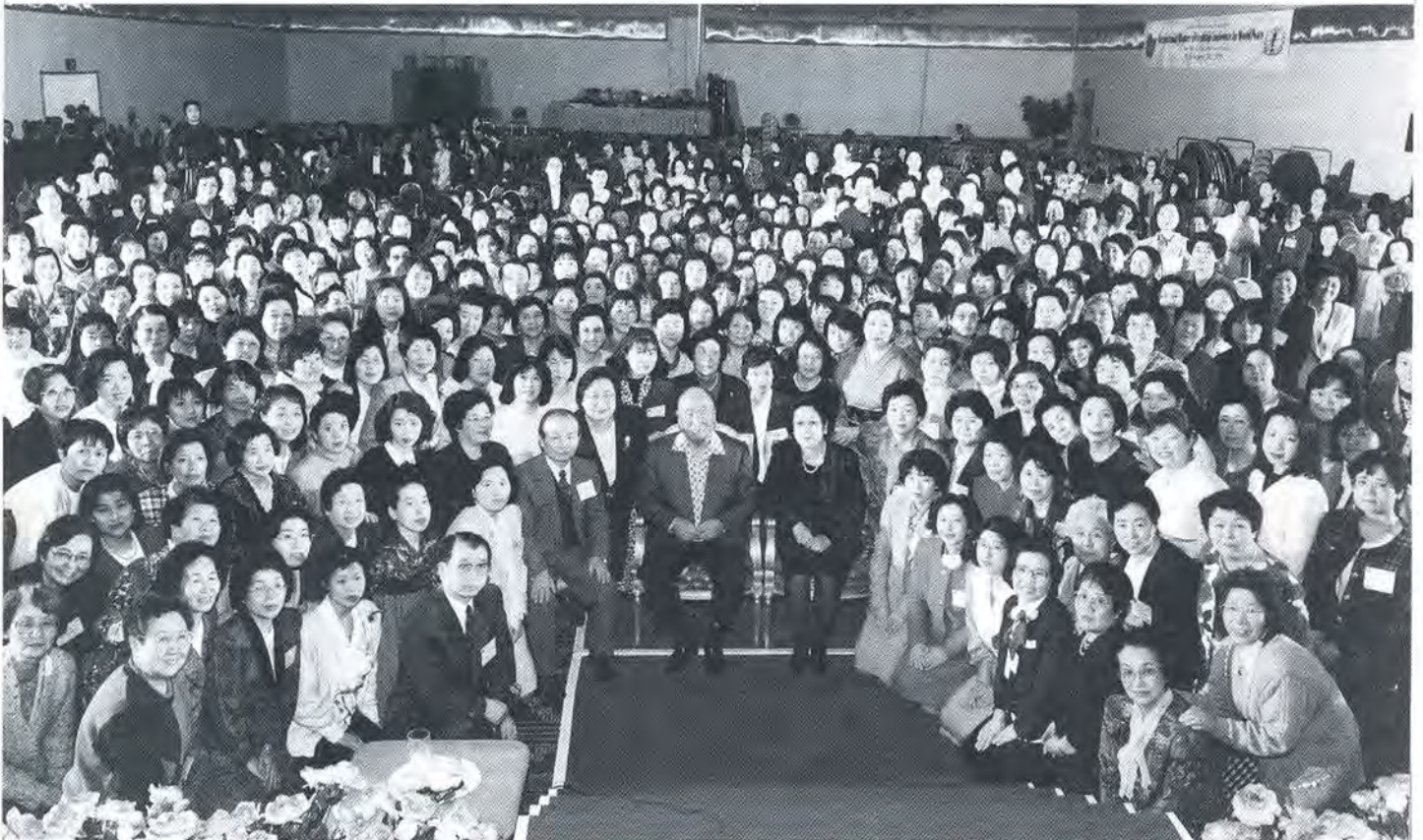
True Parents (seated center) pose with the Japanese women during an International Women's Friendship Conference for World Peace in Washington, D.C.

Charles Darwin's theory of evolution was completely incorrect. He talked about the survival of the fittest and the weak ones being sacrificed for the stronger ones. People are confused because they do not know what is subject and what is object. They do not know the formula governing the subject and object relationship. They do not know which is first, concept or substance. The concept, or love, is first, followed by the substance, man and woman. There is concave and convex.